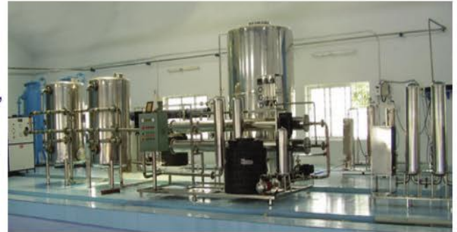
Oxyplus Mineral Water Plant