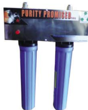
Oxyplus Industrial UV