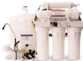
Oxyplus Under Sink