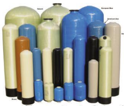
Oxyplus Softner & Iron Removal Vessels