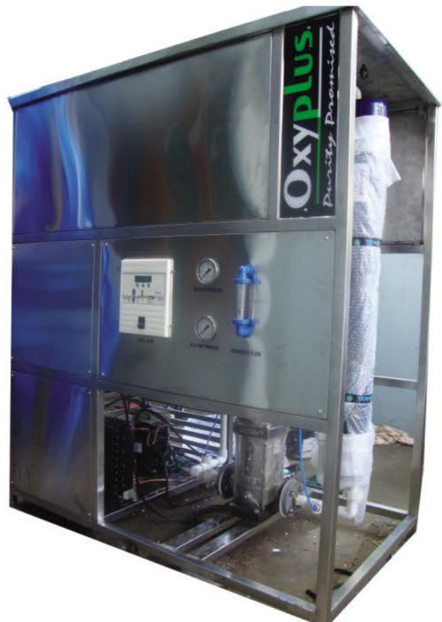
Oxyplus Water Factory