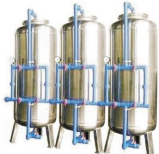
Oxyplus Water Treatment Plant